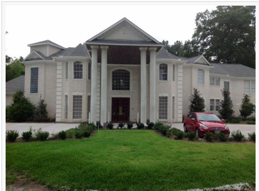
New location at 13725 Falba Road - Houston

HOUSTON, TEXAS, UNITED STATES, July 20, 2017 /EINPresswire.com/ -- DermaTouch RN has moved into its new beauty and wellness center located less than a mile away from its previous location in Northwest Houston. Located at 13725 Falba Road, the recently renovated 6,000 square foot state-of-the-art facility now offers clients a complete luxury spa retreat and the latest aesthetic treatments available in the industry. Over a year in the making, the beautiful new facility situated on a sprawling park-like estate is equipped with the latest technology and an experienced team of registered nurses and aestheticians. Together with consulting physician Scott Yarish, DermaTouch RN is strengthening its foothold as one of Houston's premier MedSpas able to offer both short and long-term aesthetic and wellness programs.