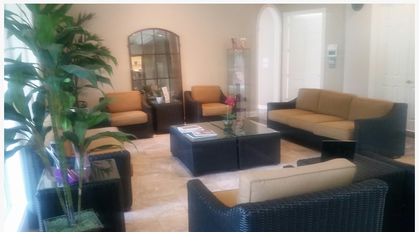
DermaTouch RN downstairs waiting area

This press release can be viewed online at: http://www.einpresswire.com