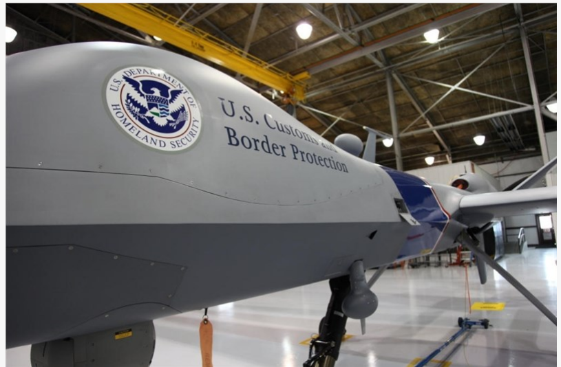
Border UAV Market Shows Interesting Opportunities

Central Asia and South America will account for over half of the world's Border and Internal Security UAV market share. Those regions will also show much more spending and much more growth than Europe or North America. All of that is without the shock of a successful cross-border terror attack. If that attack happens and results in a rush to deploy UAVs, you can expect $826 million in UAV spending in the next year for South America but only $82 million for the same year after an attack in