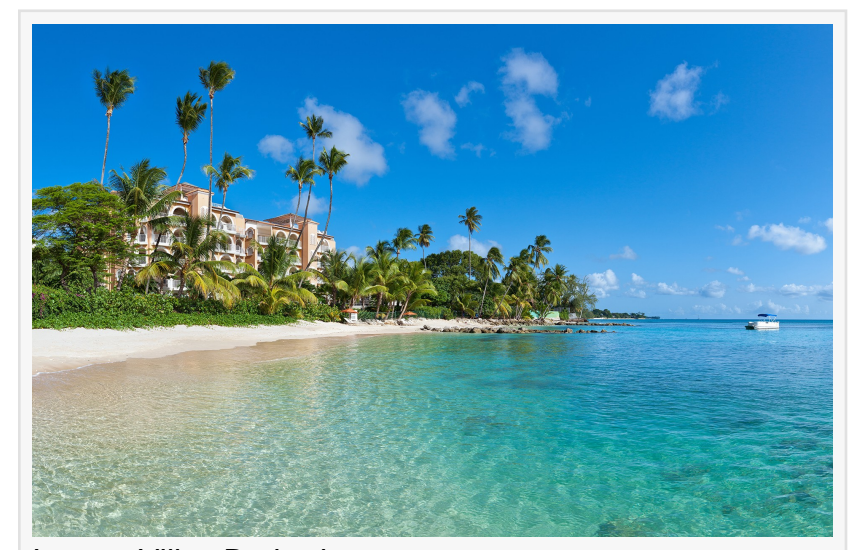
Luxury Villas Barbados

The lucky winner will receive two complimentary economy flights from London to Barbados plus a complimentary seven-night stay at the