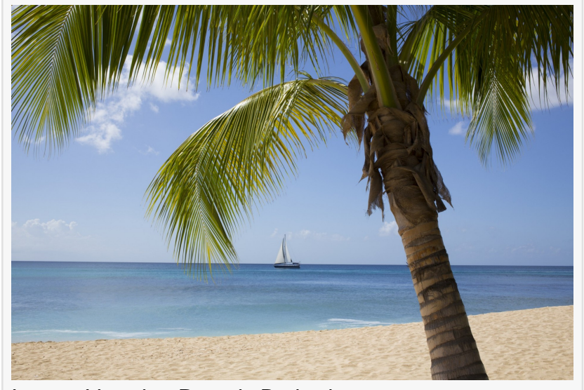
Luxury Vacation Rentals Barbados