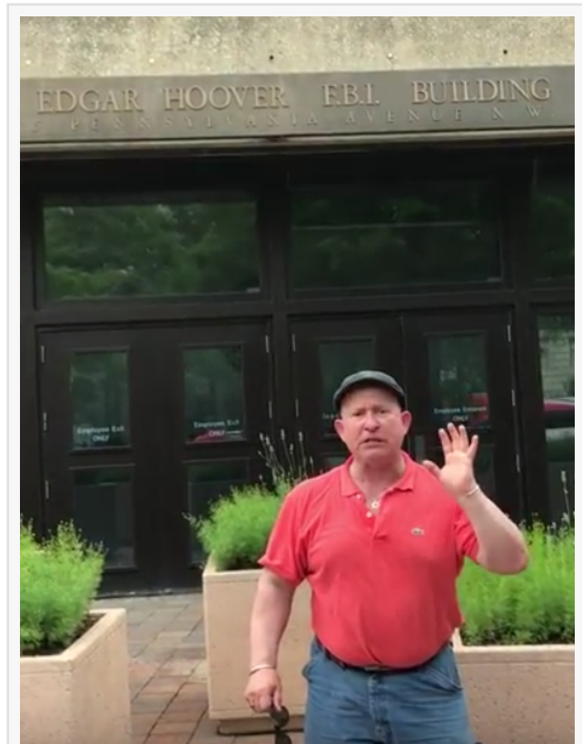
U.S. Senate Candidate Visits FBI To Report Corporate Fraud