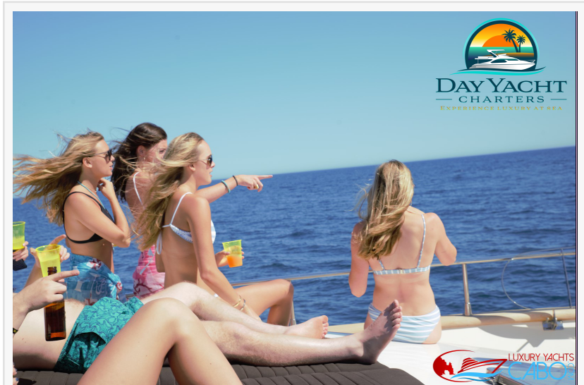
Cabo San Lucas Yacht Charters

The addition of these two new destinations virtually completes a circuit of Mexican Day Yacht Charters, Inc. locations in Mexico ranging all along the Pacific and Gulf coasts and on down to Cancun, the Riviera Maya and the island of Cozumel. Those are added to the other Caribbean and western Atlantic destinations like the Bahamas, the Grand Cayman Islands, Puerto Rico and Seattle yacht charters and boat rentals .