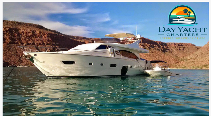
Yachting in La Paz BCS

La Paz, the capital city of the state of Baja California Sur, is an important location for luxury yacht charters in that it has grown significantly in recent years, especially since famed American author John Steinbeck visited it and wrote about it in 1940. It has become a major destination for many celebrities of the entertainment and business world as well, some of whom have chosen it over Caribbean destinations like St. Bart's. For instance, Oscar-winning film producer and director Steven Spielberg's huge yacht often can be seen anchored in the Bay of La Paz and singer, Lady Gaga, has been seen shopping there. It is a privileged location sitting right on the bay from which it gets its name and, also, hard by the Gulf of California, better known as the Sea of Cortez. Los