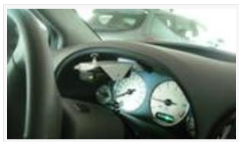
can be mounted in mnutes on the windshield

322 years after the discovery of the Universal Force of Inertia (a.k.a. Second Law of Motion) by Isaac Newton, this American invention makes anyone driving any car or trucks to "eco-drive" instantly. "It's as easy as using your speedometer and it amazes me to see the number of articles including the US