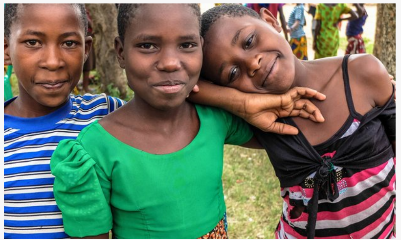
3 Girls at the FGM Safe House in Mugumu