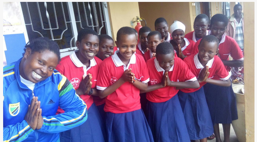
Girls at the FGM Safe House in Mugumu

One of the main goals of the project is to map regions where female genital mutilation (FGM) is prevalent, thus supporting efforts to eradicate this practice. Having better maps helped prevent 2257 girls from being cut during the last cutting season in Tanzania. During the event, the participants will be invited to further contribute to this goal by mapping any of these tasks: http://bit.ly/MapTanzania on OpenStreetMap.