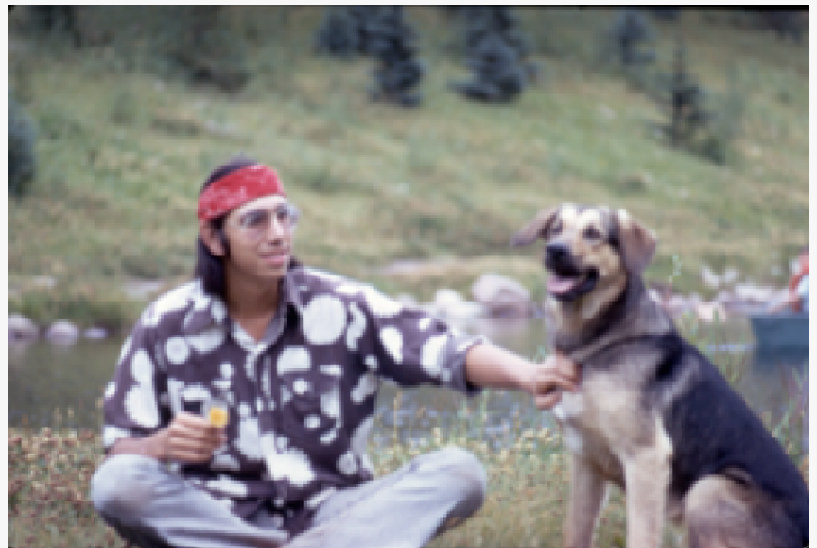
The Woodstock Festival: 3 Days of Peace & Music

Learn of the performances, behind the scene shenanigans, and the future of the stars