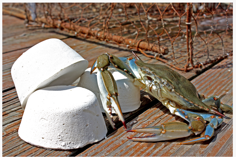
OrganoBait™ can stem the usage of forage fish to capture crustaceans.