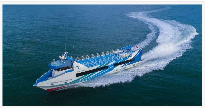
The Patagonia Xpress - The New Fast Boat to the Gili Islands

Licenced for 184 passengers, the Patagonia Xpress was built to the highest of standards by Pt Citra Shipyard. Launched in 2017 she is the newest, largest and most comfortable boat transporting holidaymakers between Bali, the Glli Islands and Lombok. The Patagonia Xpress is 33 meters long and 6 meters wide, and is powered by two inboard engines, giving her a maximum cruising speed of 30 knots. Power on board is provided by two Mitsubishi gen-