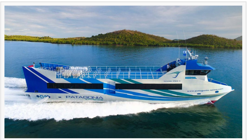
The Patagonia Xpress on her Daily Voyage from Bali to the Gili Islands

Putting the customer's experience at the heart of everything they do, booking your ticket on the Patagonia Xpress couldn't be simpler; you can book directly with their easy to use and secure online booking platform, which can be found on the Patagonia Xpress website -<u>https://www.patagonia-xpress.com/</u> Patagonia Xpress are offering special introductory rates of IDR 350K single, or IDR 700K return. Children under the age of three years travel free of charge and the price includes free transfers from