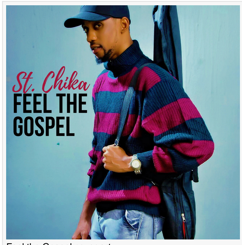
Feel the Gospel cover art

"Feel the Gospel is an album that I hope touches lives around the word. An album I hope will help them draw closer to God