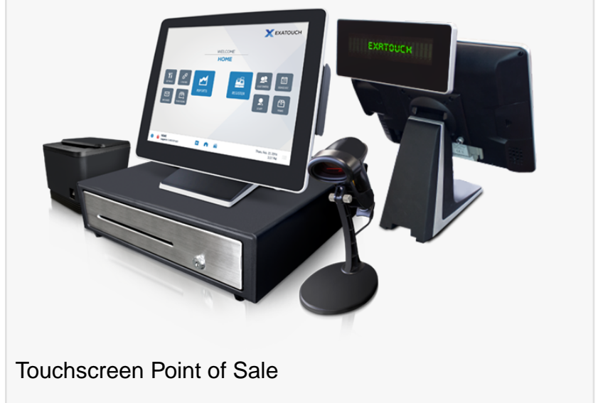
Touchscreen Point of Sale

99merchantaccount.com provides nationwide services are now available in the following geographical areas: