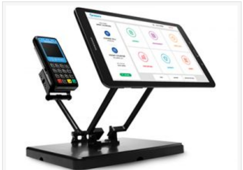
Portable Point of Sale