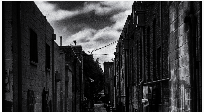
Pill Head will be film on location in Petaluma, CA.

This press release can be viewed online at: http://www.einpresswire.com