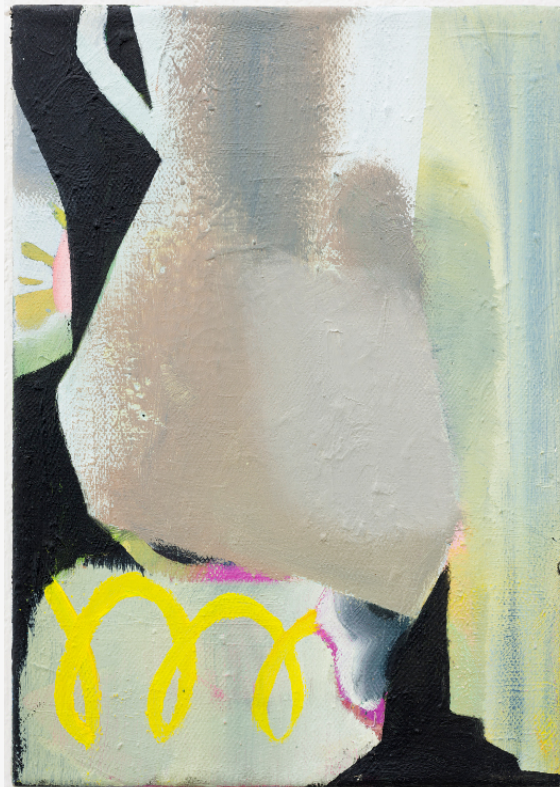
Carolyn Israel, "Krug" ("Pitcher"), 2016: RPR ART.