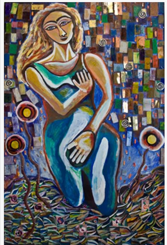
Image: Moira Cue; Solitude; 1992, Acrylic on Masonite (Private Collection)