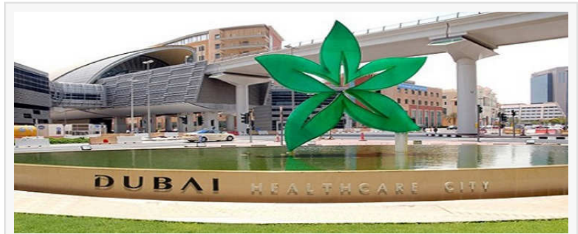
World Laparoscopy Training Institute at UAE

The World Laparoscopy Training Institute at Dubai Healthcare City in Dubai have set up collaboration with the aim of fostering the development of new applications of laparoscopic and robotic surgery. Such collaboration entails the development of a network of internationally renowned minimal access