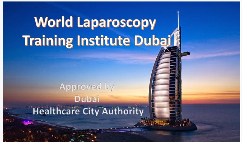
World Laparoscopy Training Institute Dubai, Dubai, UAE