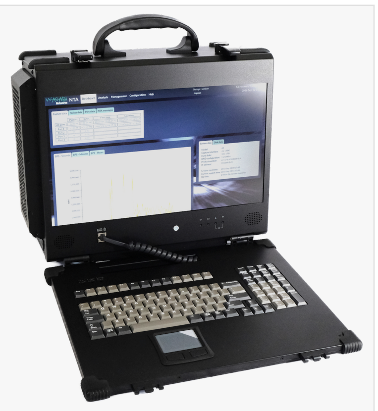
2 x 10G Portable Network Traffic Analyzer

The Portable NTA is designed to be used anywhere networks needs to be tested in