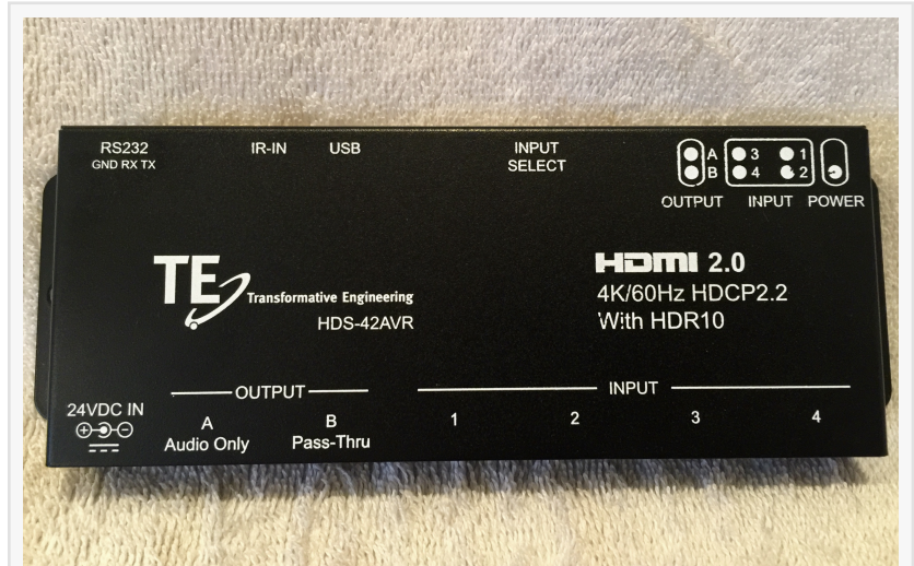
Bringing Hi Resolution Audio and Ultra Hi Definition Video together