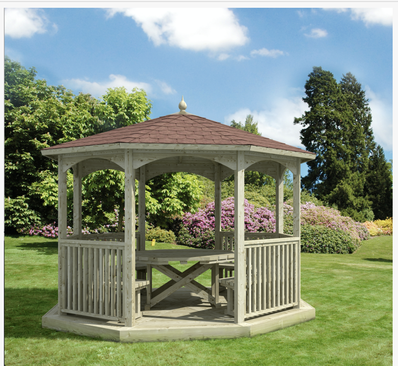
Anchor any garden space with this lovely gathering space

European Garden Living wooden garden décor and furniture product has been known for its highest quality and unique design for the past three decades being manufactured by one of the leading European outdoor manufacturer's. The European Garden Living has just announced exhibiting at the largest outdoor furniture trade show in the United States - Chicago Casual Market. Trade Show starts on September 12, 2017.