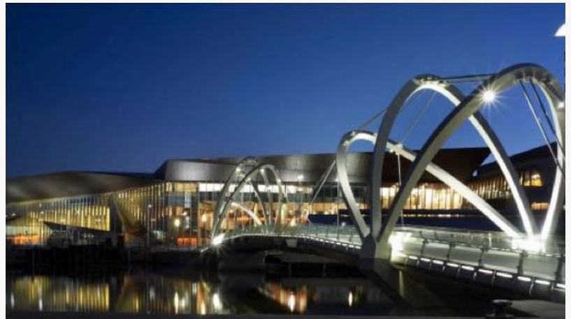
TouchStar will attend APFI 2017 at the Melbourne Convention and Exhibition Centre