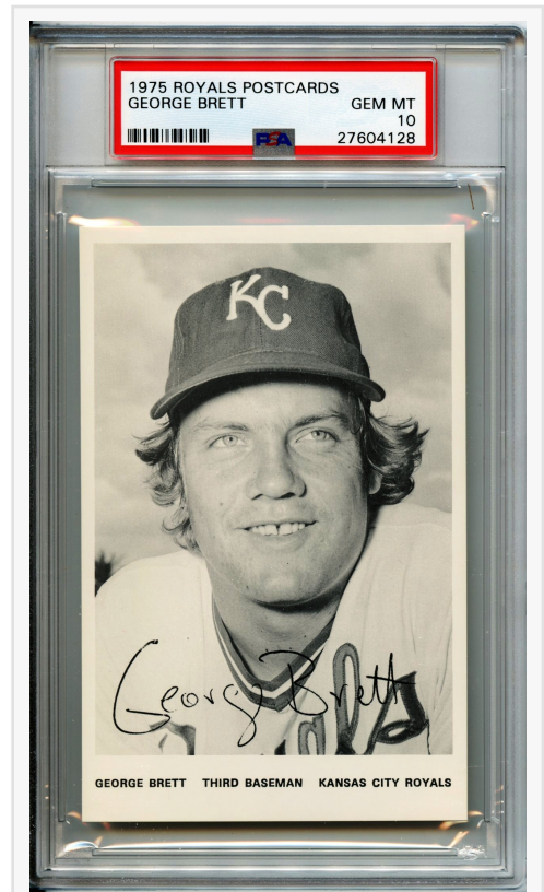
Rare 1974 George Brett Kansas City Royals postcard rookie card.