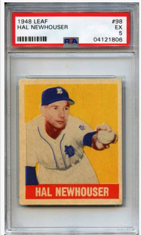
1948 Leaf Hal Newhouser rookie card, in outstanding condition.