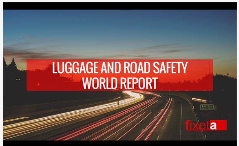
LUGGAGE AND ROAD SAFETY WORLD REPORT

This press release can be viewed online at: http://www.einpresswire.com