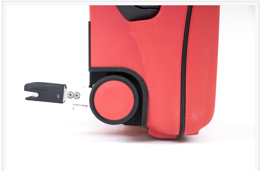
Fixeta - Detail

Esther Berzosa Fixeta 0034647464665 email us here