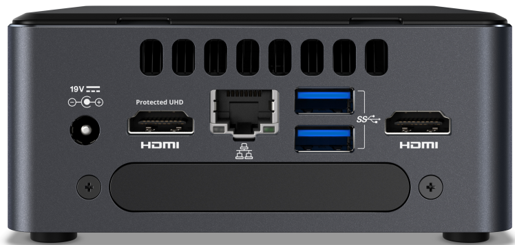
The NUC7i5DNHE Back