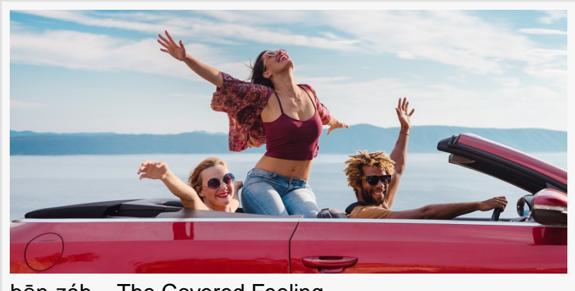
bōn-záh = The Covered Feeling

Pablow has partnered with Arch Insurance Group to underwrite the car rental damage insurance policy across the country. As a digital agency licensed in all 50 states and D.C., Pablow is on a