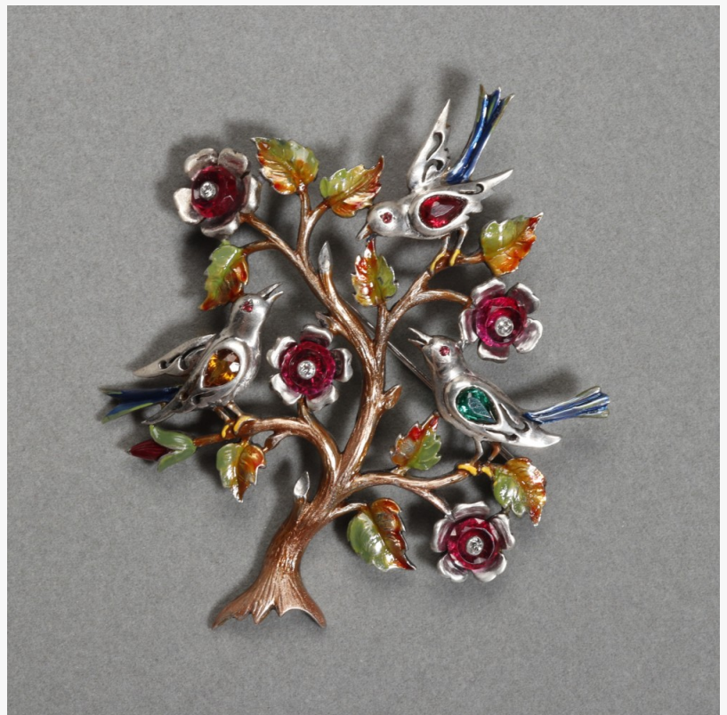
Unsigned Dujay pin with transparent enamel birds in a tree and unfoiled red crystal flowers.