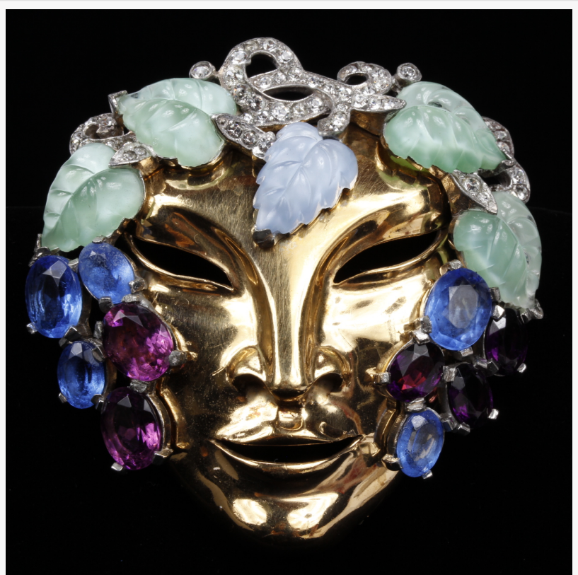
Very scarce Mazer Bacchus clip mask with rhinestones.

Lots #243 and 244 are early mixed-media art glass, brass and cord Modernist pendant necklaces by the Chicago artist Michael Higgins, circa 1960s, both with estimates of $500-$1,000. Also, a very scarce Mazer Bacchus clip mask with rhinestones, decorated with pale green and light blue leaves and one of the rarest pieces by this maker of themed masks, should fetch $1,200-$1,500.