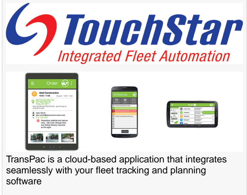
TransPac is a cloud-based application that integrates seamlessly with your fleet tracking and planning software