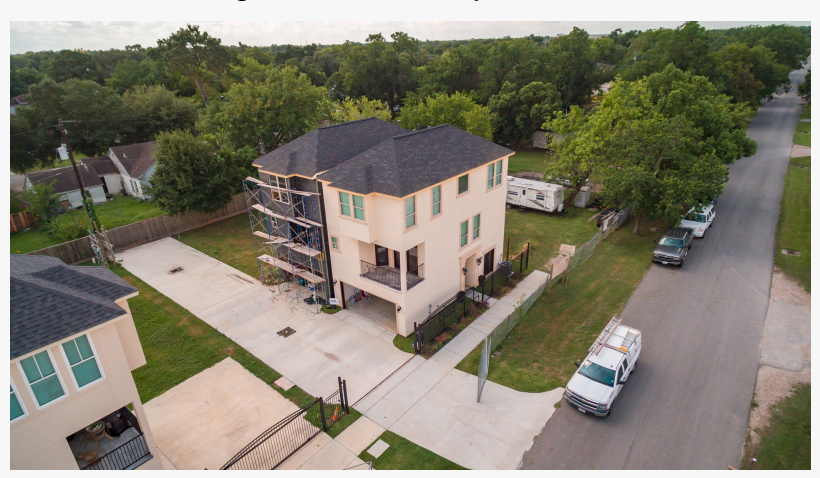
Opportunity abounds with 2 finished homes, one unfinished home and development lots!