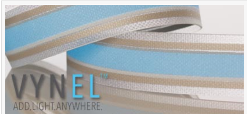
Add Light. Anywhere

Future Illuminations was launched in response to demand for customers wanting to #AddLightAnywhere and plans to refine their inverter line for every market, including bluetooth functionality and DMX integration over the next 12 months.