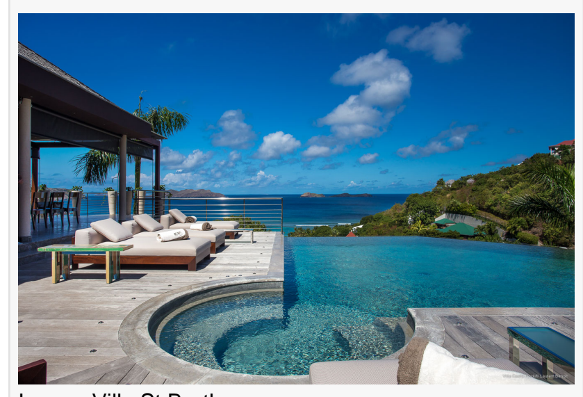
Luxury Villa St Barths