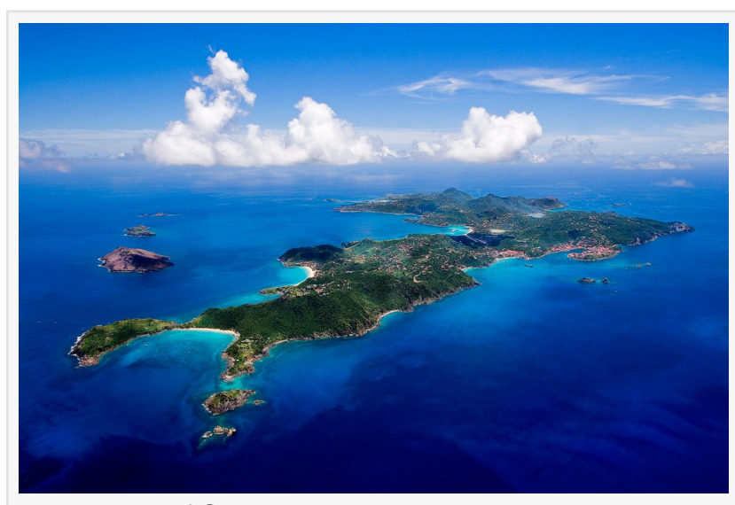
Aerial View of St Barts

NEW YORK, UNITED STATES, September 20, 2017 /EINPresswire.com/ -- The Caribbean island of St Barts is getting ready to welcome all their visitors for the upcoming festive season. The people on the island are working effortlessly to get the island back to its former glory after hurricane Irma. It has been two weeks since hurricane Irma passed over the Caribbean and caused extensive damage to the island of St Barts and surrounding islands. However, the people of St Barts have come together to help each other recover from the hurricane and have shown massive improvements in such little time.