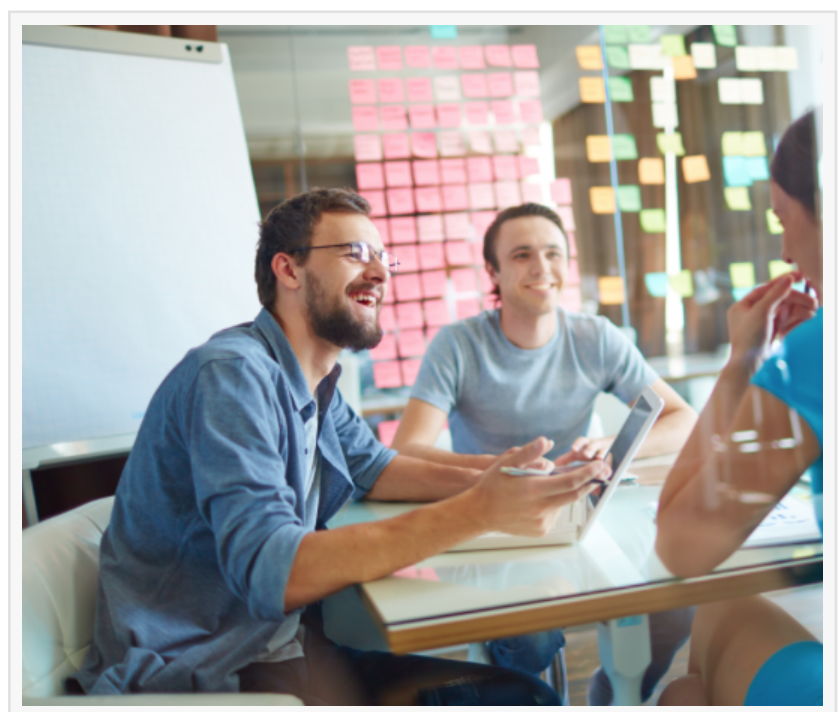
Ethica Solutions training for healthcare professionals

Solutions provides CPD Certification and <u>SFJ Awards</u> accredited child and adult safeguarding courses, investigation