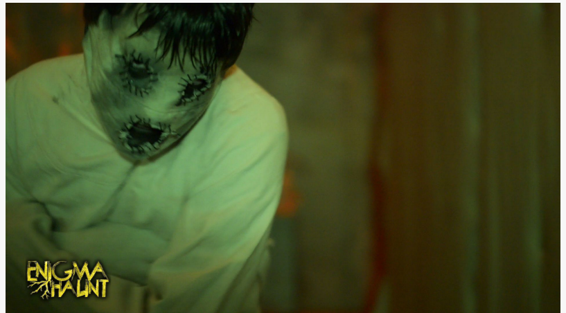
A taste of what you are in for at Enigma Haunt