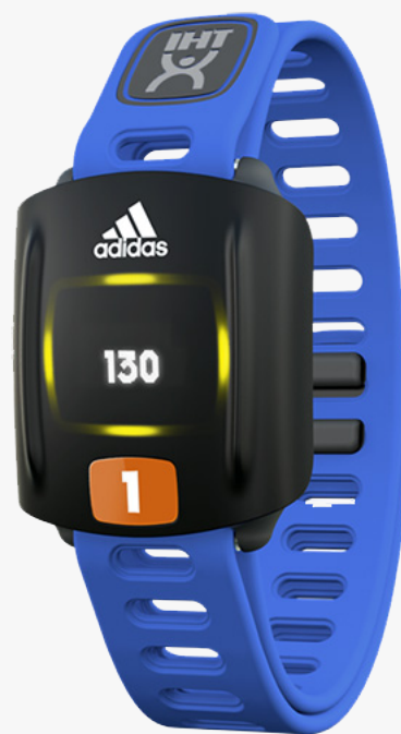
Along with adidas, IHT released a wrist-based heart rate monitor designed specifically for P.E. in 2016.

Designed to bring personalized learning through Physical Education classes, the IHT Spirit System® empowers teachers to inspire ownership of health in students utilizing heart rate data and software