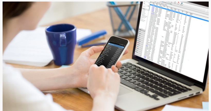
DejaOffice CRM - Contacts Widget in Action