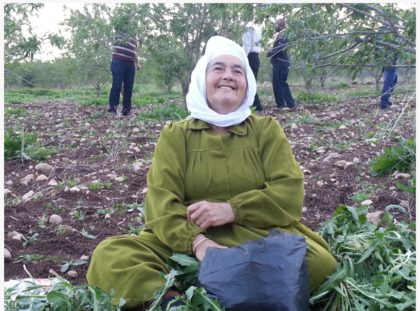
Harvest time in Jenin

This press release can be viewed online at: http://www.einpresswire.com