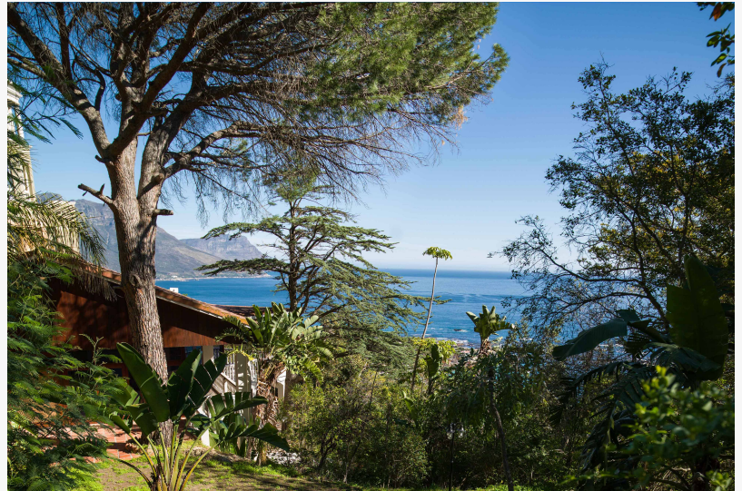
One of the houses

Cape Town Building Boom Cape Town is experiencing an unprecedented building boom, and the price of real estate has soared to new heights. According to the Weekend Argus, a respected South African news organization, over $1.5 billion (20 billion South Africa Rand) in