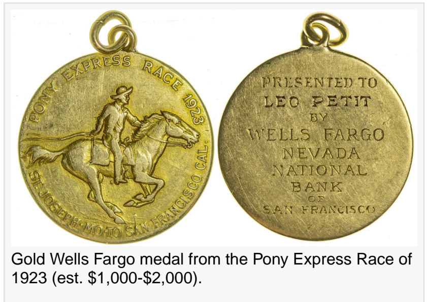
Gold Wells Fargo medal from the Pony Express Race of 1923 (est. $1,000-$2,000).

Fred Holabird Holabird Western Americana, LLC (775) 851-1859 email us here