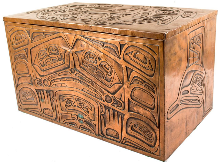
Stunning Northwest Haida hand-embossed copper over wood chest (est. $1,000-$3,000)