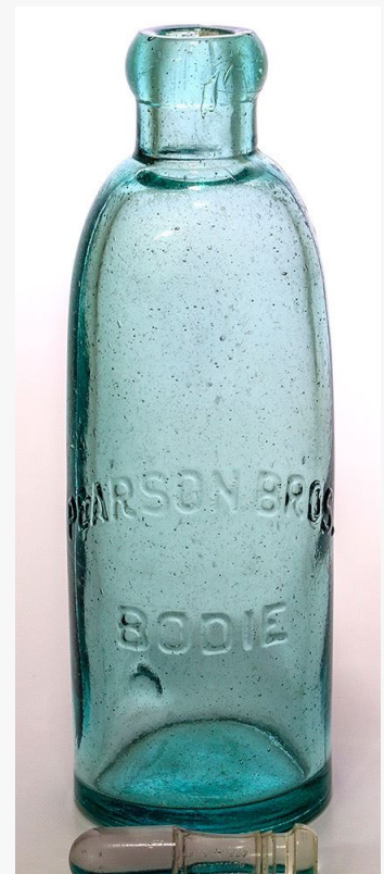
Bodie (Calif.) Pearson Brothers soda bottle, circa 1880s (est. $2,000-$5,000).