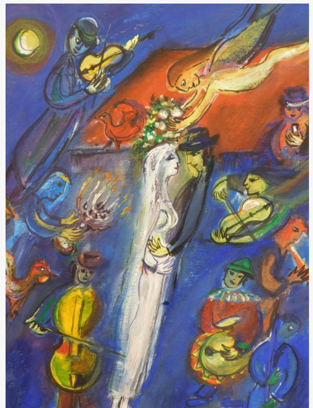
Gouache on paper attributed to Marc Chagall, titled Lovers ($40,000).