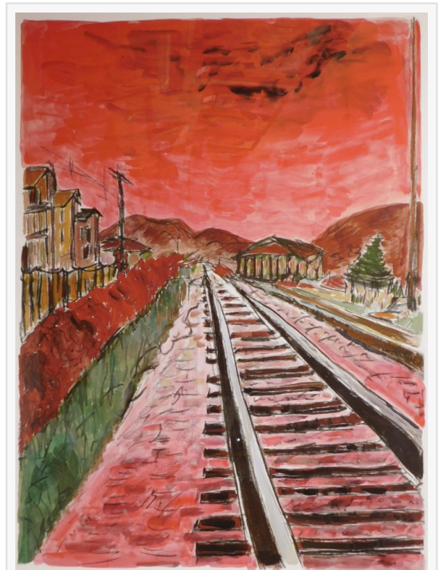
Giclee print signed and numbered by Bob Dylan, titled Train Tracks ($5,312).