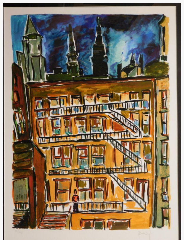
Giclee print signed and numbered by Bob Dylan, titled Cityscape ($3,750).

The oil and tempera Still Life Study attributed to Claude Monet (1840-1926), executed circa 1867 and signed by the French painter, sold for $37,500 and bears the faint impression of the stamp of Collection Foret in Nice, France. Also, an oil and tempera on canvas attributed