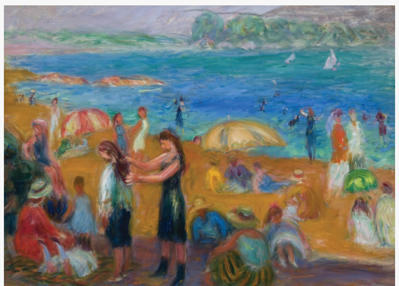
Oil on board by William Glackens (Am., 1870-1938), titled The Bathers .