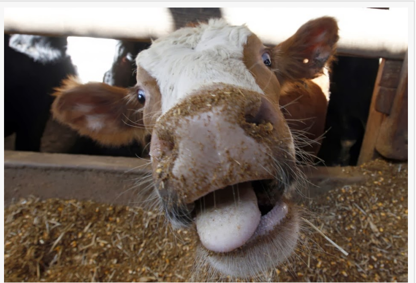
Cannabis and Mad Cow Disease