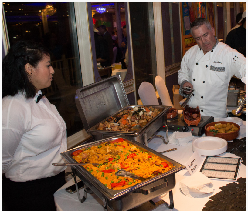
Sample seafood, prime meats, poultry, plant-based cuisine, desserts, and much more at The Taste