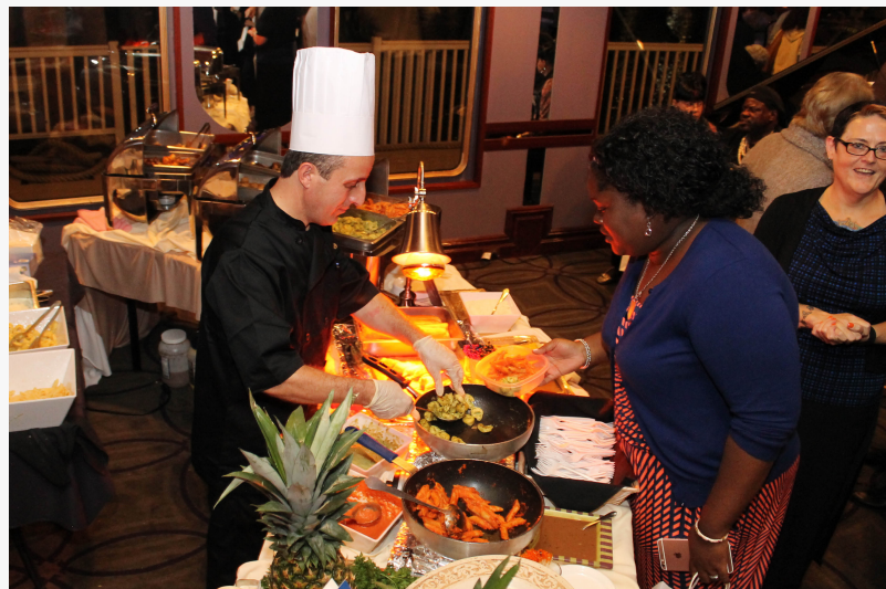
The Taste features wonderful food and creatively-decorated serving stations in a relaxed environment.

PERTH AMBOY , NEW JERSEY, UNITED STATES OF AMERICA, October 17, 2017 /EINPresswire.com/ -- Taste of Perth Amboy is attracting record levels of support from local restaurants and food lovers as the community celebrates its spectacular cuisine on Thursday, October 19, beginning at 6 PM. The annual sampling of the food specialties prepared by the City's top Latin and international chefs will be held aboard the Cornucopia Cruise Line's St. Charles vessel, which is docked at 401 Riverview Drive.