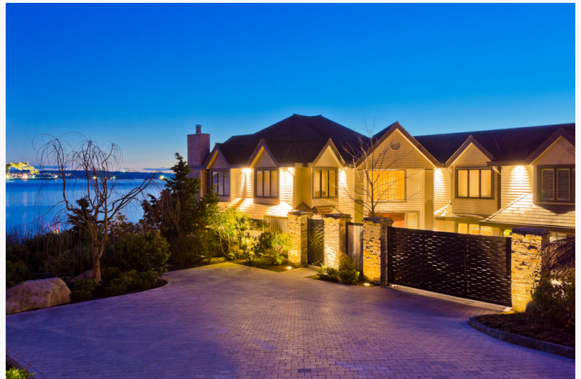
.... in haute display for your pleasure.

The Luxury Property Show runs from 27th – 28th October at the London Olympia. For further information about the show and opportunities to either exhibit or visit, head to http://www.theluxurypropertyshow.com/ .