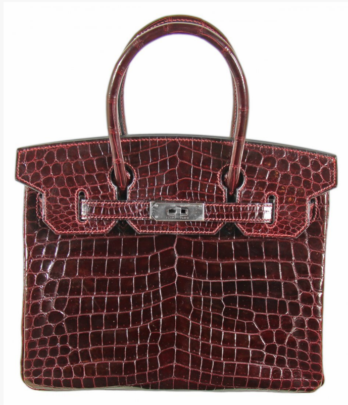
Hermes shiny crocodile Birkin women's handbag, in pristine condition.