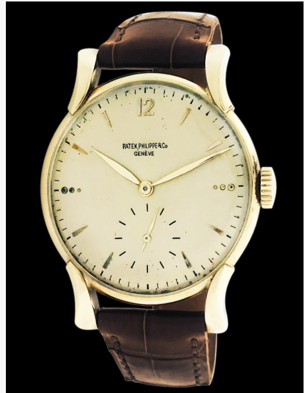
Patek Philippe & Co. (Geneva) yellow gold men's wristwatch with jeweled movement.