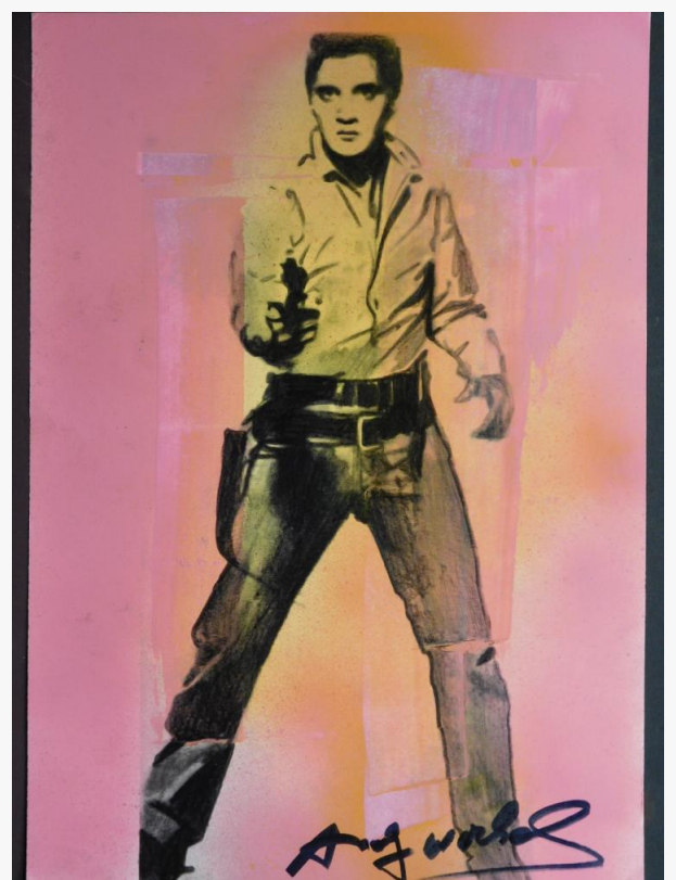
Unframed mixed media drawing on paper of Elvis Presley by pop art icon Andy Warhol.

Bruce Wood Woodshed Art Auctions (508) 533-6277 email us here