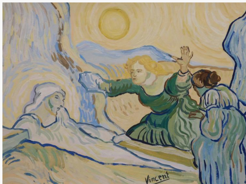
Unframed tempera on paper attributed to the Dutch master Vincent Van Gogh.

An oil on canvas abstract composition attributed to the New York-based non-objective, ethnic genre-view painter Norman Lewis (1909-1979), signed and framed, is expected to hammer for $15,000-$20,000. The painting was reportedly confiscated by the Russian Government in the 1960s and later returned to its rightful owners after the breakup of the Soviet Union in the ‘80s.