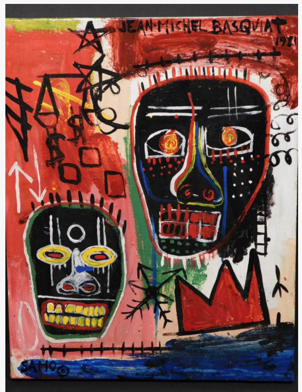
Oil and enamel on canvas attributed to Jean-Michel Basquiat (Am., 1960-1988).