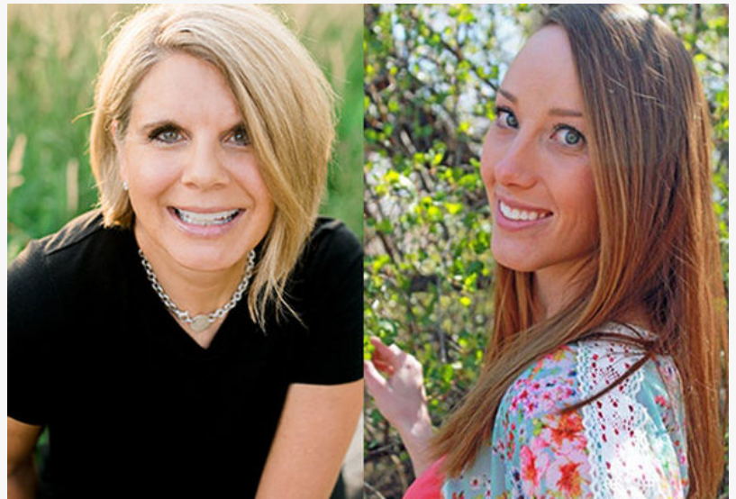
Perio Protect Orkos Award Winners

The patient exhibited generalized periodontal disease, with moderate to heavy bleeding, calcified bacteria below the gums, and spaces between his teeth and gums measuring up to 7mm (normal is