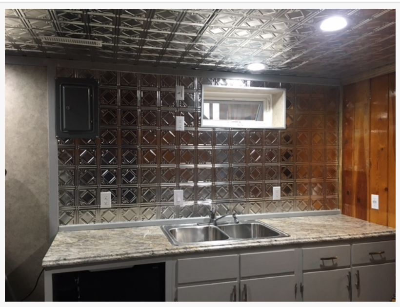
This 6" diamond pattern is used on the wall, as well as the ceiling, sprucing up this area.

In the past they could be found in drug stores, ice cream parlors and hardware stores. Today they are being used in pharmacies, desert courts, coffee