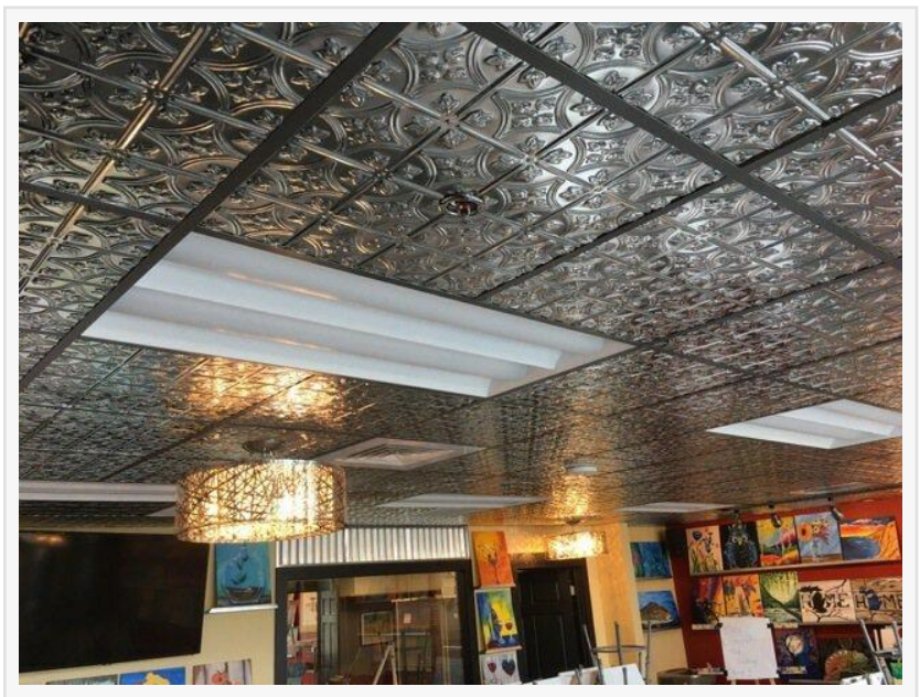
This art shop used a Victorian design in their suspended ceiling giving a comfortable feeling to their patrons.

HOUSTON, TEXAS, USA, October 31, 2017 /EINPresswire.com/ -- One thing that remains common throughout the years in the United State is our ability to change things up. By that I'm referring to the industry that has been around since the beginning of time. First building homes for shelter, then for the in-laws and finally building for businesses. One product that has kept up with those changes are tin ceilings that came along right after the Civil War and are still very much available currently through Chelsea Decorative Metal Company in Houston, Texas. The designs throughout the years changed with the times. You could find