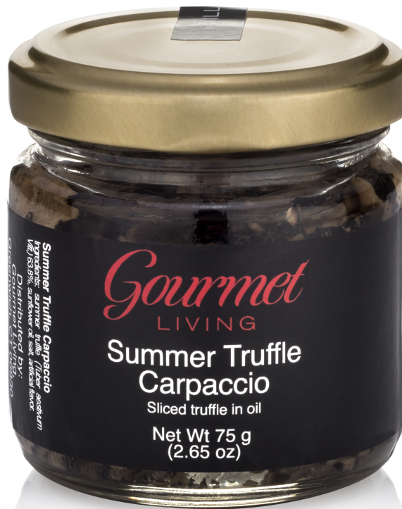
Sliced summer truffles in sunflower oil

Sheila May Gourmet Living +1 203-629-1530 email us here