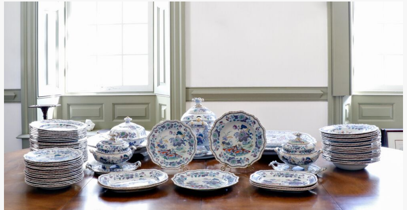
Gorgeous Hicks & Meigh 78-piece ironstone dinner service.