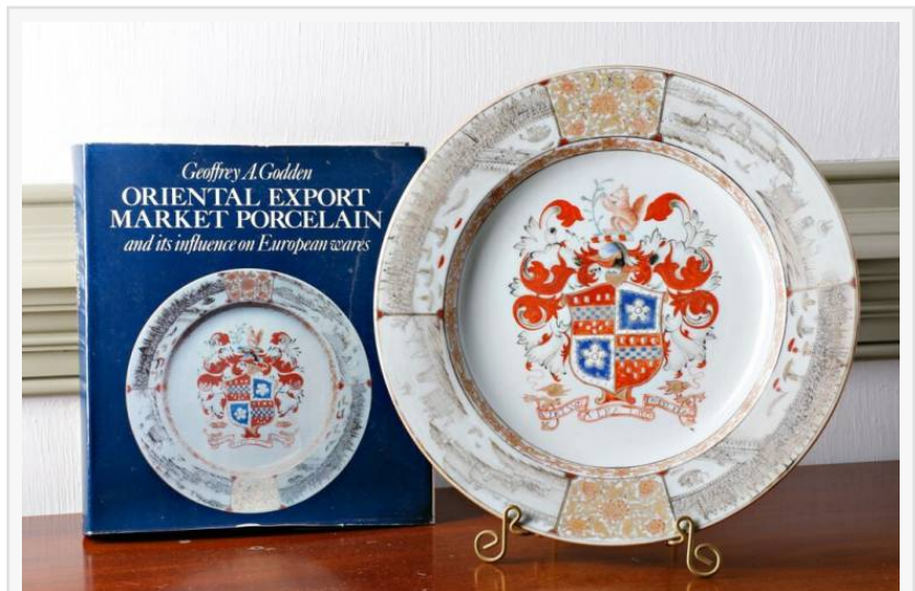
Circa 1735 Chinese Export famille rose and grisaille porcelain dish.