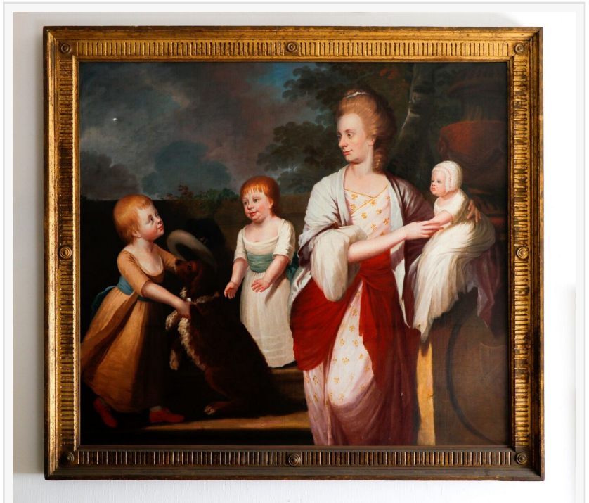
Oil on canvas portrait from the Circle of Sir Thomas Beech (Br., 1738-1806).

Also sold will be a Continental bronze garden statue of the goddess Diana, 33 inches tall, shown standing with her hand resting on the antlers of a deer, having a nice weathered green patina (est. $3,000-$5,000); and a nice English or American pair of 19th century Regency giltwood convex girandole mirrors with eagle mounts, purportedly purchased at Israel Sack (est. $2,000-$4,000).