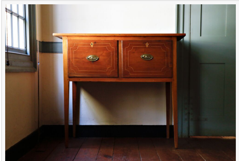
Early 19th century Southern Federal inlaid hunt board with two deep drawers.