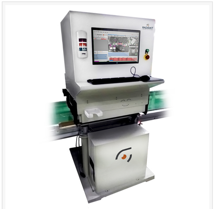
The INSPECT.assembly system detects the presence, position, and integrity of components including screws, cables, connectors, and other critical features before final device enclosure to automate assembly inspection.

Radiant’s new INSPECT.assembly system is a turnkey inspection station that employs ProMetric® Y imaging systems with camera resolution (up to 29 megapixels) and dynamic range (above 70 dB) far