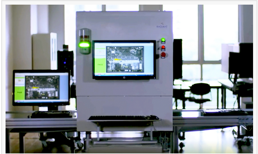
Occupying the same physical footprint as a human operator on the line, the INSPECT.assembly system easily rolls onto moving conveyers, adjusting to heights from 525-950 mm.

exceeding the specifications of typical machine vision systems. Applied in photometric measurement of light and color in displays and backlit components, ProMetric cameras capture fine-detail images with a level of precision that rivals human visual acuity. Because INSPECT.assembly is fully-integrated with Radiant camera, lighting, fixturing, and software, Radiant engineers are able to design each INSPECT.assembly to match the specifications of each customer application. This advanced vision technology solves critical inspection challenges through a combination of the image registration & analysis functions of the camera with proprietary machine vision “super tools” in INSPECT Software, which blend multiple machine vision software algorithms in a single tool to enable comprehensive analysis of specific features. For instance, a tool can be engineered with the unique algorithms required to locate the routing path of a cable to ensure that it is properly seated around guides on a board-based assembly.