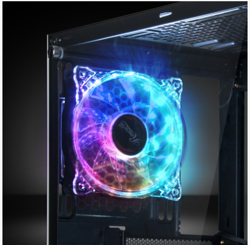
The new CULLINAN MX features gorgeous tempered glass panels and 4 pre-installed RGB LED case fans with a convenient remote

CITY OF INDUSTRY, CALIFORNIA, UNITED STATES, November 7, 2017 /EINPresswire.com/ -- Rosewill, a leading provider of PC hardware at excellent value, has redesigned their best-selling tempered glass, ATX mid tower case - the CULLINAN - to include brilliant RGB shine. The new CULLINAN MX features gorgeous tempered glass panels and 4 pre-installed RGB LED case fans with a convenient remote, giving users the ability to set the fans to their favorite color with preset lighting effects. The remote offers users the ability to switch among the 8 color options with breathing mode and 4 lighting effects; plus, adjust the brightness to shine parallel with in-game excitements at their thrilling paces.