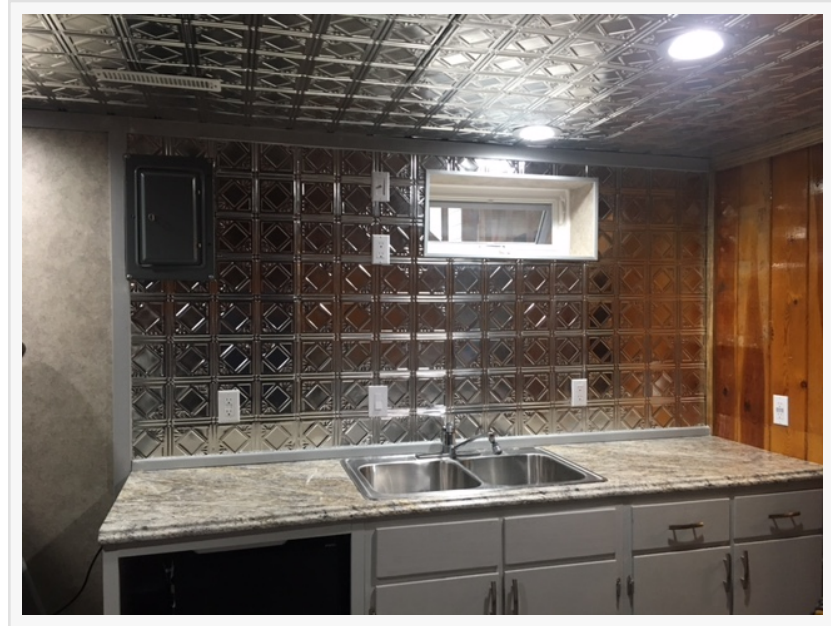
This 6" diamond pattern is used on the wall, as well as, the ceiling sprucing up this area.

You can use this material for more than just ceilings. Wainscoting, wall coverings, a backsplash or behind a wood stove and it's even used in arts and crafts projects. The website is easy to remember: http://www.Tinman.com and the doors are now open to the world. Orders can now be sent to London, England, Paris, France, Tokyo, Japan, Hong Kong, Shanghai and Beijing, People's Republic of China, Singapore, Southeast Asia, Seoul, Korea, Brussels, Belgium, Madrid, Spain, Sydney, Australia, Dublin, Ireland, Berlin and Frankfort, Germany, Vienna, Austria, Moscow, Russia, Amsterdam, The Netherlands, Stockholm, Sweden, Copenhagen, Denmark, Zurich,